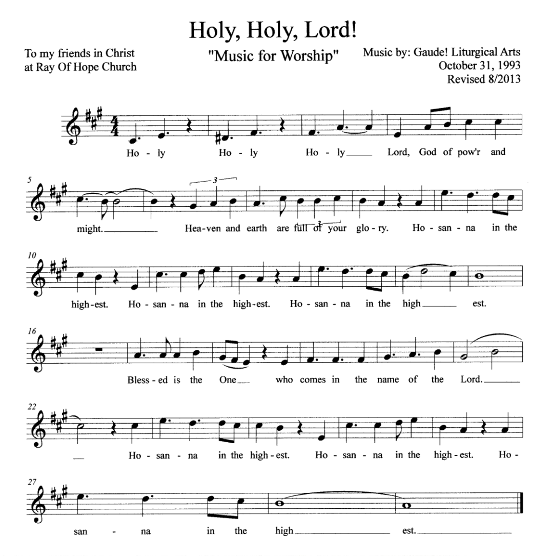
©1993 by Gaude! Liturgical Arts. All Rights Reserved. International Copyright Secured. Reprinted here under CCLI#706121

(Impromptu prayer offered.) May our voices be one with their praises right now as we sing our song and join in their unending hymns of praise.